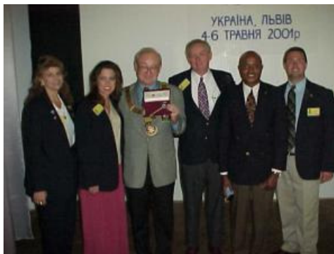
6920 GSE Team in Ukraine

You can meet the inbound team and provide hospitality when the next visiting GSE team is in your area. You can also recommend local individuals to be members of our outgoing team and you may even want to be considered in the selection process for becoming a District 6920 GSE Team Leader on a future exchange.